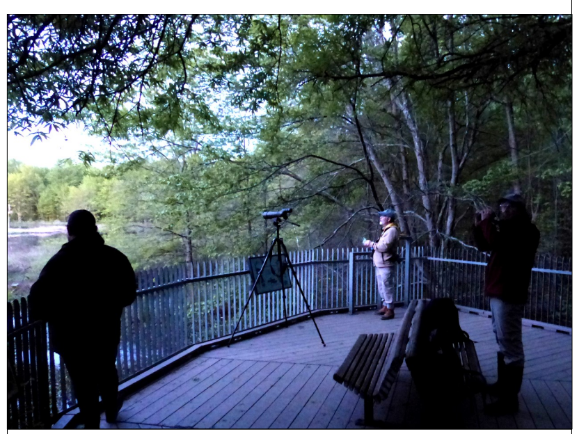
Bird-a-thon Beyond! participants practiced social distancing at HMP while observing various bird species.

Thanks to all of those who contributed financially as part of Bird-a-thon Beyond! You helped us fund our 2020 Natural Resource Management Intern.