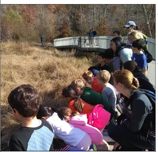
School children observing exciting animals in the wetland.

Visitors, virtual and live, received an enhanced experience from items purchased by Friends that support naturalist-led programs.