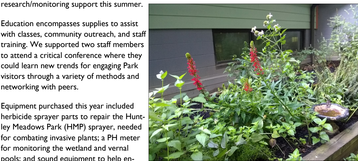
A renewed native plant berm around the Norma Hoffman Visitor Center.